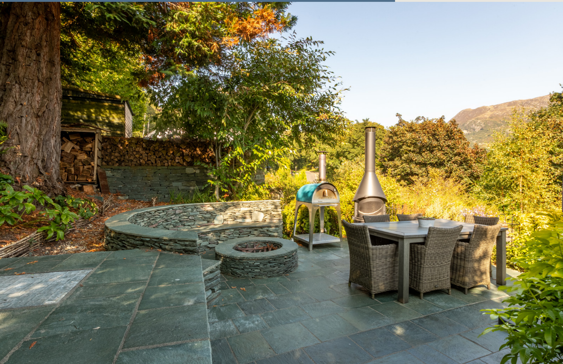
CHAPEL COTTAGE - GLENRIDDING